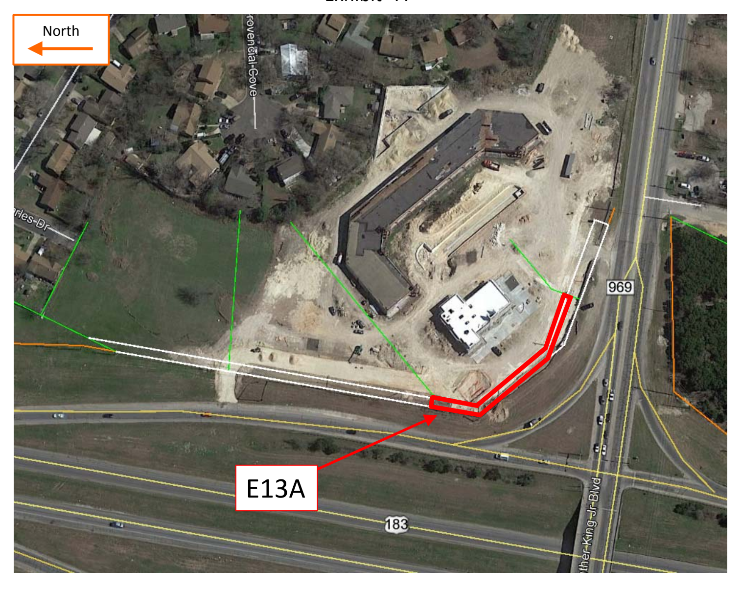
Parcel E13A – Approximately 5,372 Square Feet.